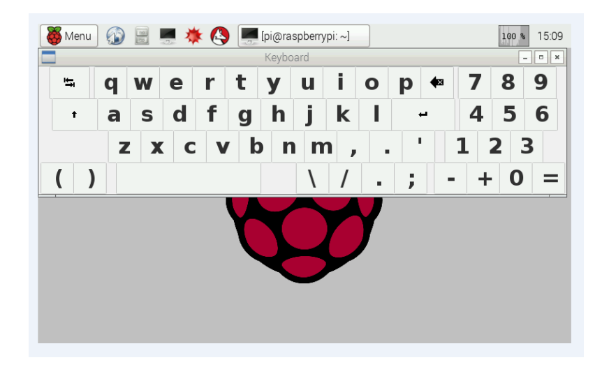
Figure 2: Virtual keyboard of Raspberry Pi

Now, the virtual keyboard is ready to use, as Figure 2 shows.